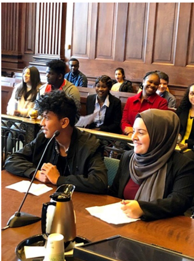
10th graders at Blackstone Academy Charter School in Pawtucket, RI, use the federal court house in Providence to conduct a mock trial. Judges working at the court house volunteered to preside over the trial.