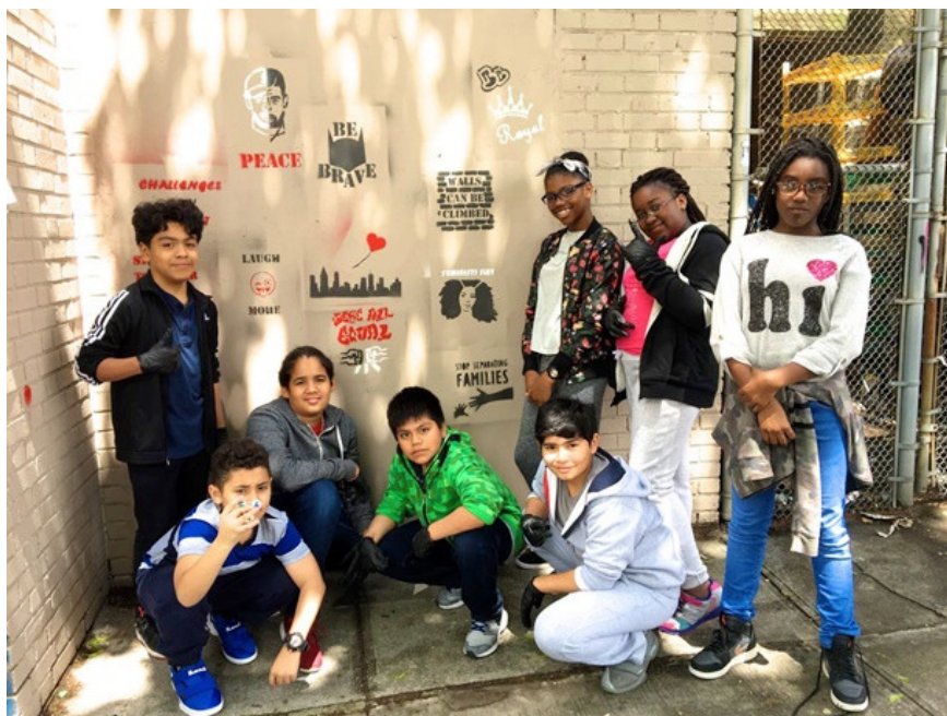
Students from Bronx Community Charter School create socially-themed stencil art in Norwood, a working-class neighborhood in The Bronx, NY.