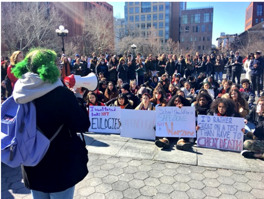
A student from Harvest Collegiate High School in New York City tells hundreds of students from other NY schools about her cousin, a student at Stoneman Douglas High School in Parkland, FL, at the time of the February 2018 school shooting there.

With regard to Individual Fit, if we believe that the goal of education is to help each student thrive, now and in the future, and if we accept that each student comes equipped with a unique set of needs, interests, and abilities, then we’ll need to chart different paths towards ‘success’ for different students and provision ourselves accordingly. The alternative is the familiar refrain that “school works for some kids, but not for others.”