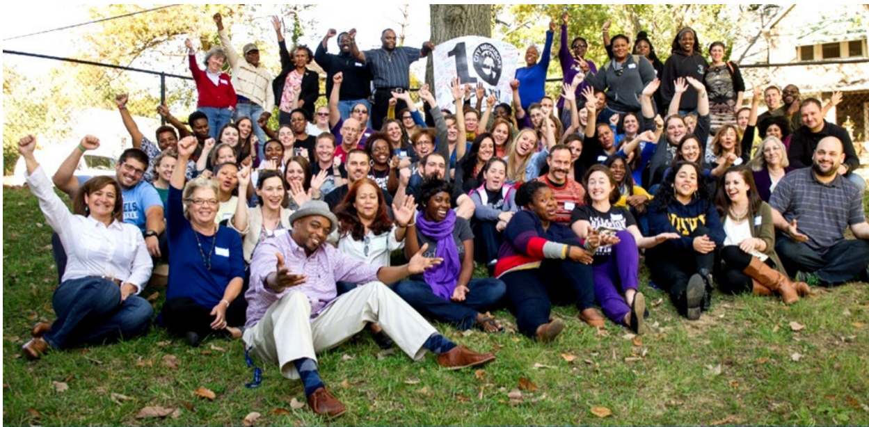
Staff members celebrate the tenth anniversary of City Neighbors Foundation, which runs three public charter schools in Baltimore, MD.

Many of us on the team are parents, and all of us have been or are currently classroom teachers. We share the hope of every parent who sends their child to school that school will be a place of safety, belonging, intellectual challenge, and joyful discovery. As educators, we've felt the rich sense of accomplishment and excitement when we've created environments and experiences that truly engage and inspire. Like you, we look forward to the day when engagement-based education becomes the rule rather than the exception, and we acknowledge and deeply appreciate the efforts of the educators, students, and families in the schools we visited and others just like them who are leading the way.